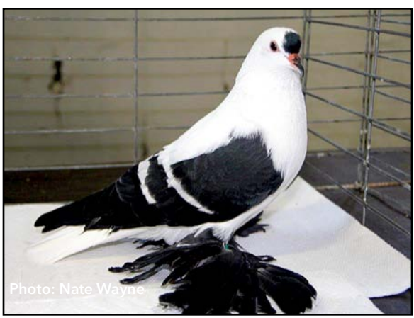
NYBS) Best Silesian Swallow, Black White Bar, By Jim Grober