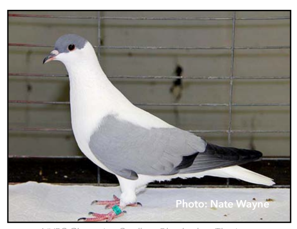
NYBS Champion Swallow, Blue barless Thuringer Swallow by Eric Kooker