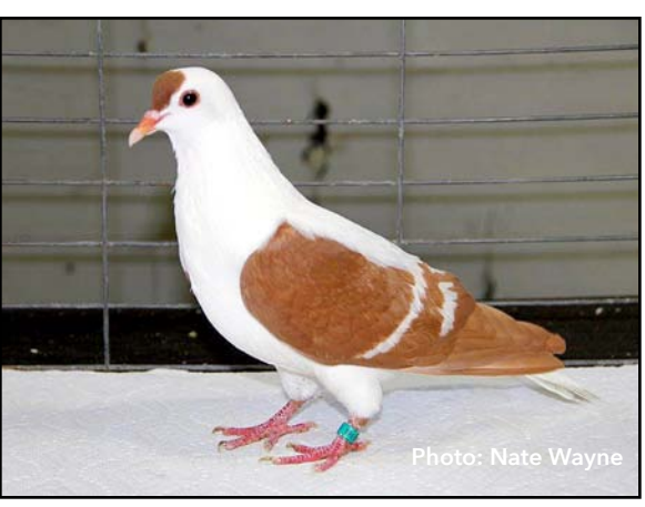
NYBS) Reserve Champ Swallow, Yellow WB Thuringer by Perry Mueller