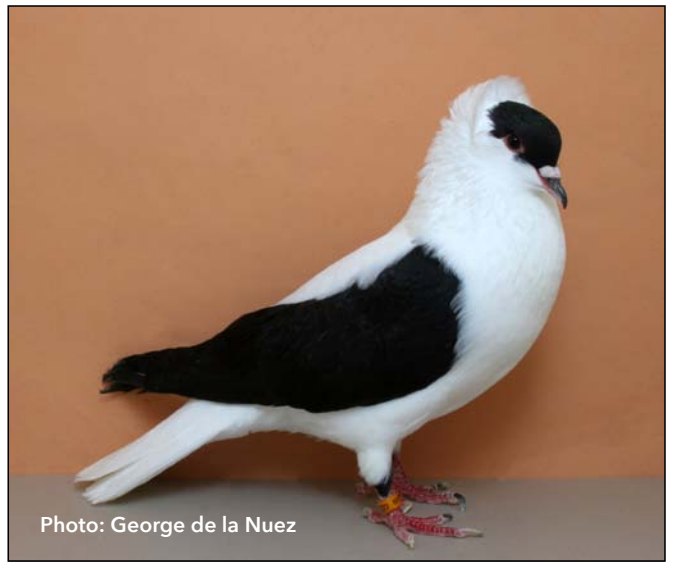
Best Thuringer Swallow, HS96, Brian Goodwin