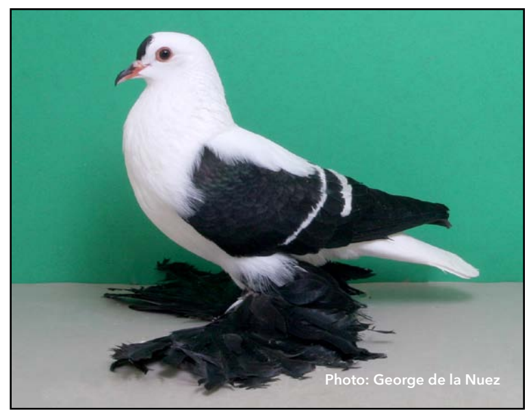
Best Silesian Swallow, YH #480 rated HS96, Bill Griebel