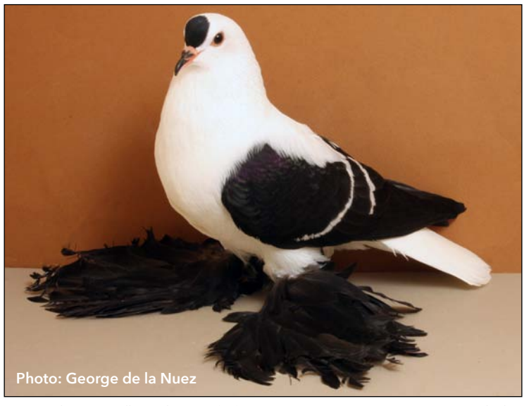
Best Silesian Swallow (Plainheaded Saxon Wing Pigeon) OH #66 (HS96) Black white bar, owner: Bill Griebel Continued on page 4