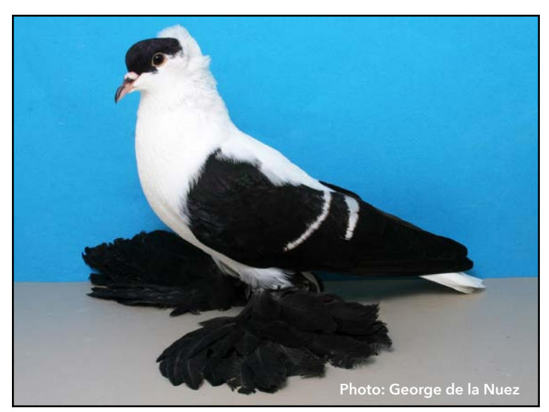
Saxon Fullhead Swallow YC 451 rated S95, Chris Auer