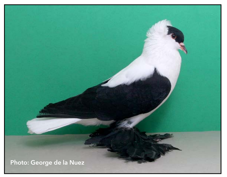
Best Fullhead Swallow, YH #467 rated S95, Bill Griebel