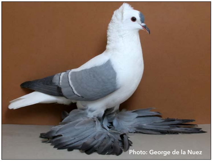
Champion Swallow of the USC Annual Meet: Blue White Bar Crested Saxon Wing Pigeon (Fairy Swallow) YH#256 (E97) George de la Nuez. This same bird was also Champion Swallow at the Pageant of Pigeons, USC Western District Meet.