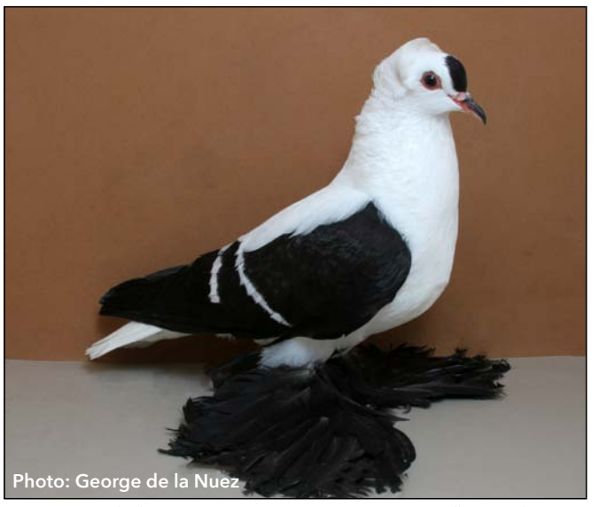
Best Black White Bar Saxon Wing Pigeon, E97, Bill Griebel